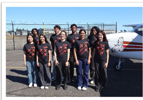
Red-Tailed Hawks FLY Class of 2025